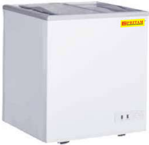
Models available - GT-100 (with 1 basket)

Pritam Flat Glass Freezers are a retailer's delight and come with fully loaded baskets for easy access & convenient segregation of frozen food.