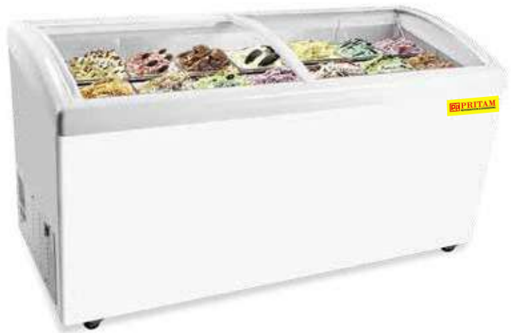
GTC 625 (with 9 baskets with 18 Separators)