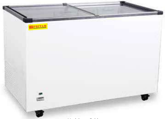
Models available - GT-255 (with 1 basket) - GT-355 (with 4 baskets) - GT-455 (with 4 baskets) - GT-555 (with 4 baskets)