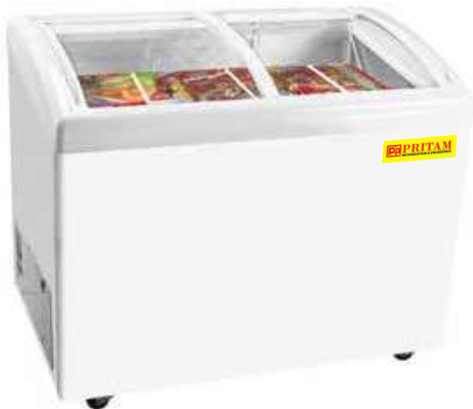
GTC 330 (with 3 baskets) GTC 450 (with 5 baskets)

Pritam Curved Glass Freezers are a retailer's delight. GTC 330 and 400 come with 3 baskets and GTC 625 has 9 baskets with 18 separators for easy access & convenient segregation of frozen food.